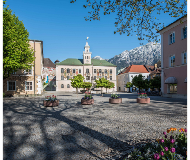
Bad Reichenhall